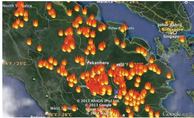
Fig. 1. Hotspot in Riau Province based on satellite image.

Area of hotspot coverage assumes a set of WSN sensors distributed over a geographical region in Riau Province to monitor that area. Coverage function P is given as: